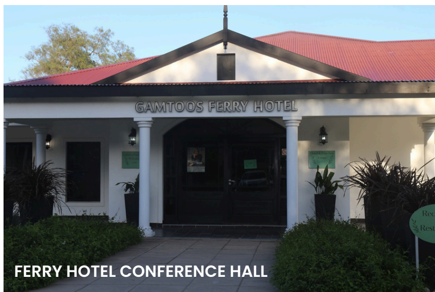
FERRY HOTEL CONFERENCE HALL