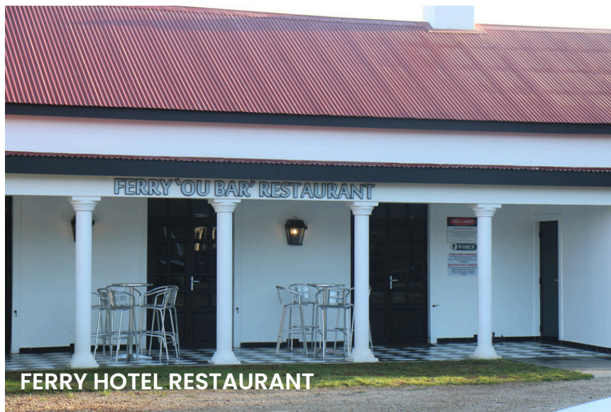
FERRY HOTEL RESTAURANT

Together, this diverse team worked in unity, reflecting the true spirit of Ubuntu – collaboration, care, and community.